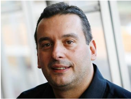
Christos Tsiolkas The In-Between